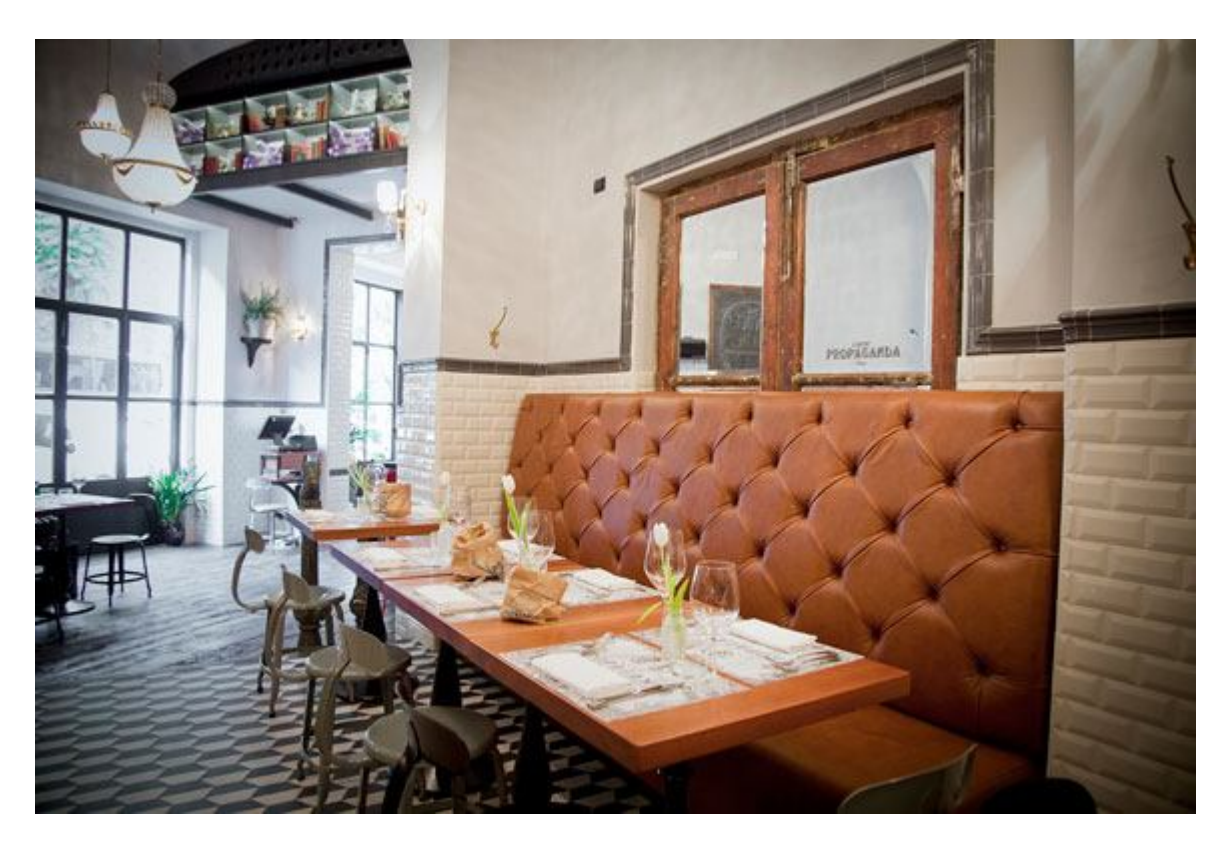
Caffé Propaganda in Rome by Made IT.